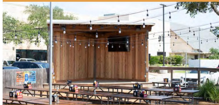
BEER GARDEN - SOUTH SIDE