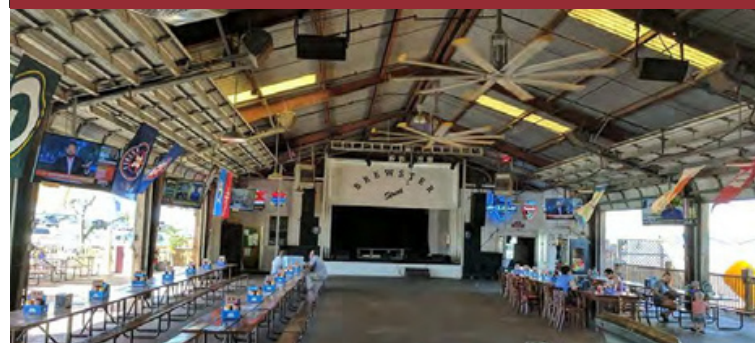
ICEHOUSE - DOWNTOWN