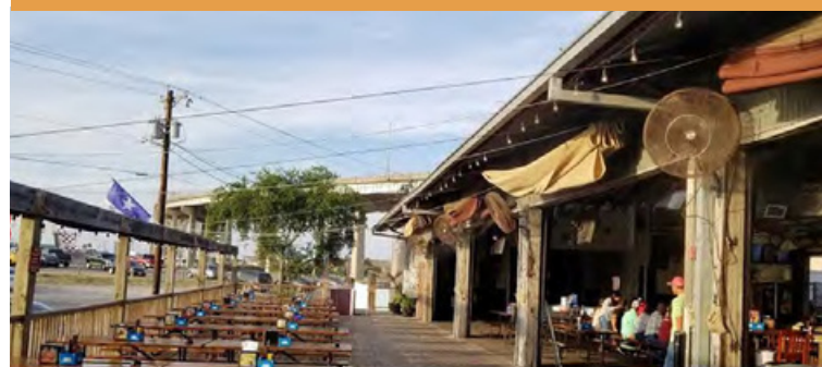
MAIN DECK - DOWNTOWN