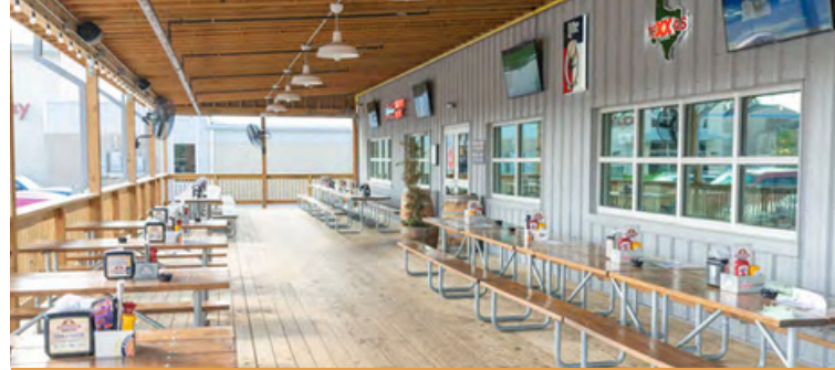
MAIN DECK - SOUTH SIDE